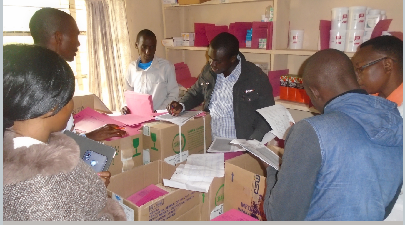
County staff carrying out data collection for quantification in Kitui Rural Sub-County.

Kitui County is working to strengthen its commodity security toward a stronger health supply chain management system for improved access to quality health services. Commodity security is a result of functioning logistical systems and aligned supportive national and county policies that lead to timely and adequate supply of commodities to health care workers and their clients.