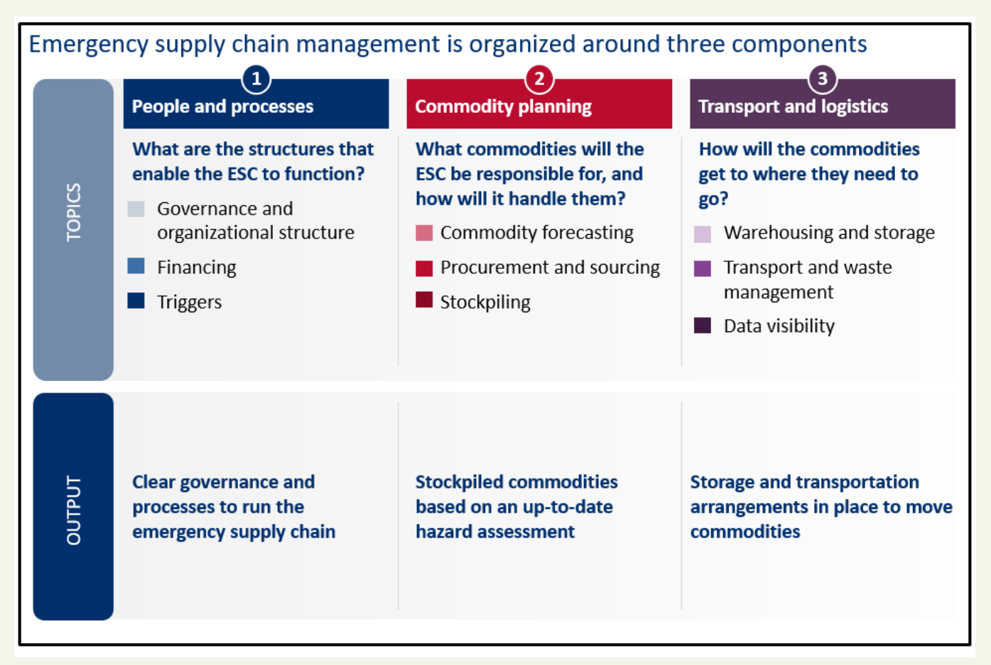
The Kenya Public Health Emergency Supply Chain Framework.

"Implementation of the Framework will put in place a system ahead of an emergency to manage the commodities required to control and contain the outbreak. This may mean procuring or leveraging partner resources, such as national or regional stockpiles of commodities, for a rapid and timely response."