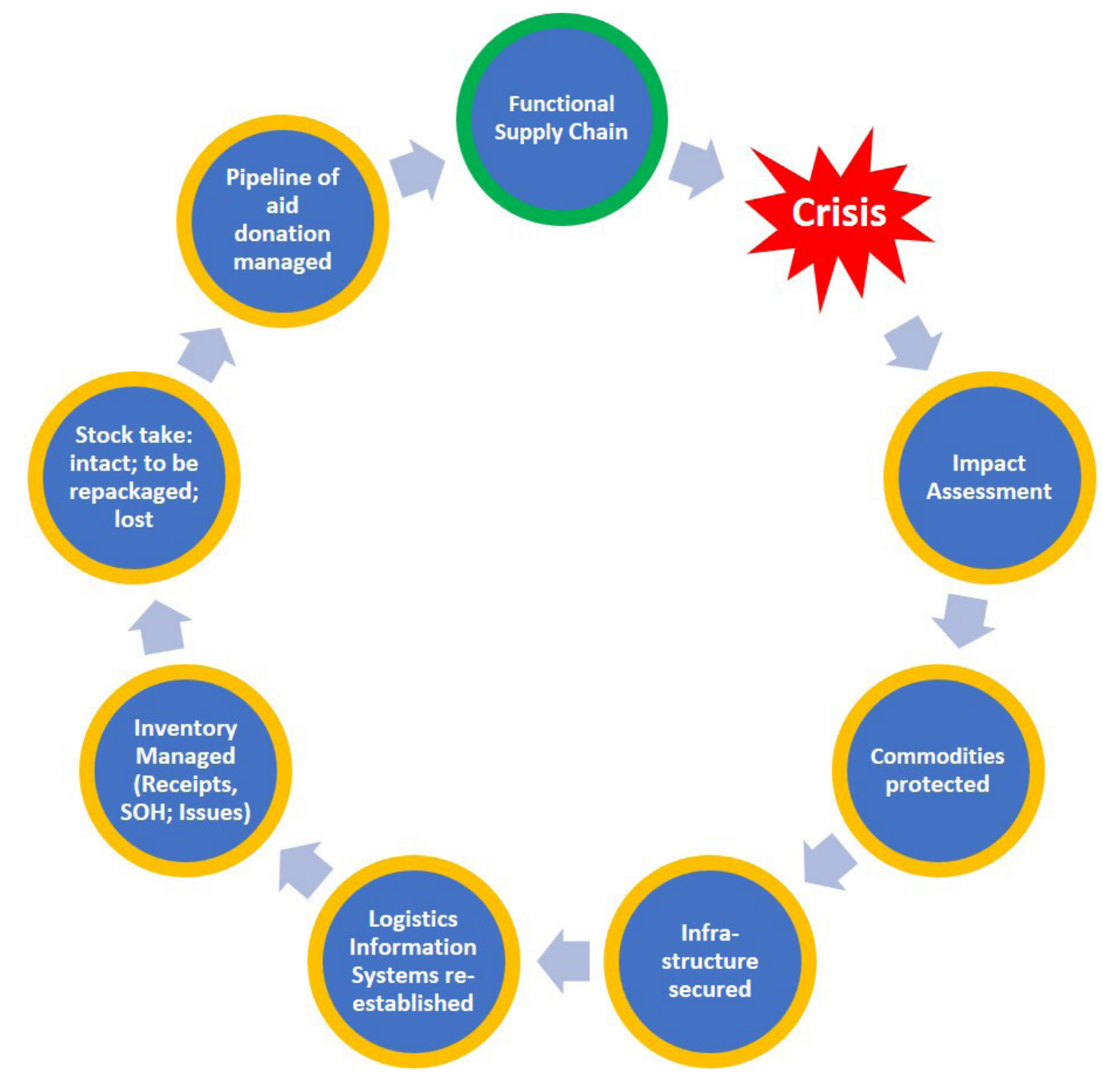
Steps in re-establishing the public health supply chain.

Watch for our "Technical Report on "Natural Disaster Preparedness & Lesson learned with Cyclone Idai" to be published soon at www.GHSupplyChain.org