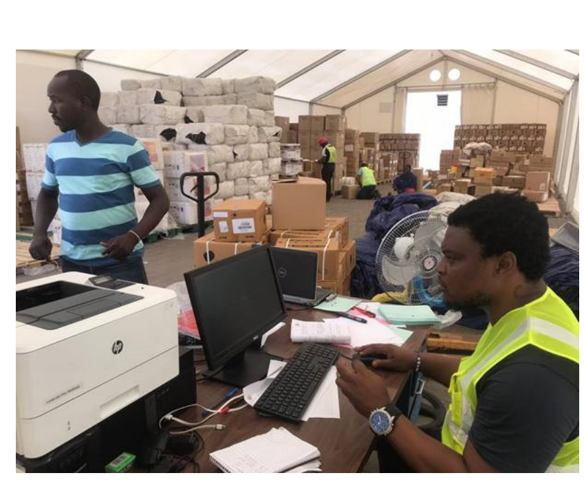
Establishing IT systems and temporary storage are key to emergency response.